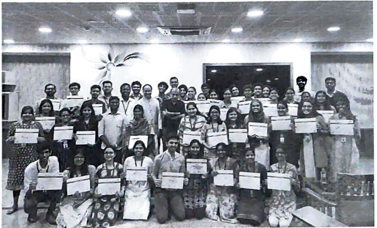
Certificate Distribution Ceremony, CHRIST BGR Campus, February 08, 2020