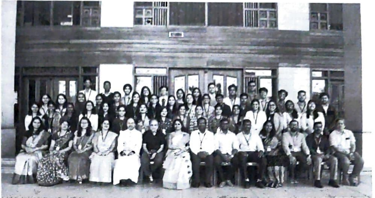
TWO DAY WORKSHOP ON ECONOMETRIC ANALYSIS USING R CHRIST (DEEMED TO BE UNIVERSITY), BGR CAMPUS 07 - 08 FEBRUARY, 2020